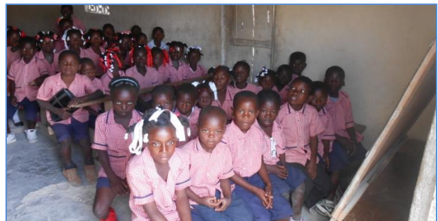
Leger Community School

program, providing access to health services for children enrolled in primary school including: deworming, micronutrient supplementation, control of malaria, as well as vision, dental and hearing screening, while strengthening the link between schools, parents, communities and local health services as a school based program.