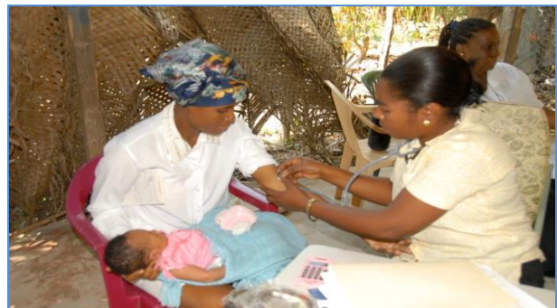
Maternal and Child Health

A newer funding source, Child and Maternal Health from Birth to Elementary School with a component of Health Care at School for 48 Elementary Schools in Archaie-Haiti, is a grant from the W.K. Kellogg Foundation of Battle Creek Michigan designed to improve child and maternal health in Archaie (Akayè), Haiti, through increased access to clinical services, pre- and post-delivery care to women and school health programs. Efforts focus on provision of preventive and clinical services for early childhood including vaccination and nutrition as a child survival