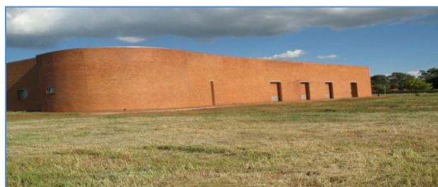
Students'/Community Center at Wilberforce Community College

The United States Agency for International Development/American Schools and Hospitals Abroad awarded five grants to AME-SADA for new construction at WCC. The grants included funding for: 1) The Multipurpose Educational Facility with classrooms, library and administration 2) The Distance Learning Center, electronic classroom, video conferencing and a resource center and five faculty residences. 3) Dormitory Facilities for male and female. 4) The Dining Hall. 5) The Students' Community Center. In addition to the five grants provided by USAID/ASHA, counterpart funding for these several structures was provided primarily by the AME-Church and its supporters.